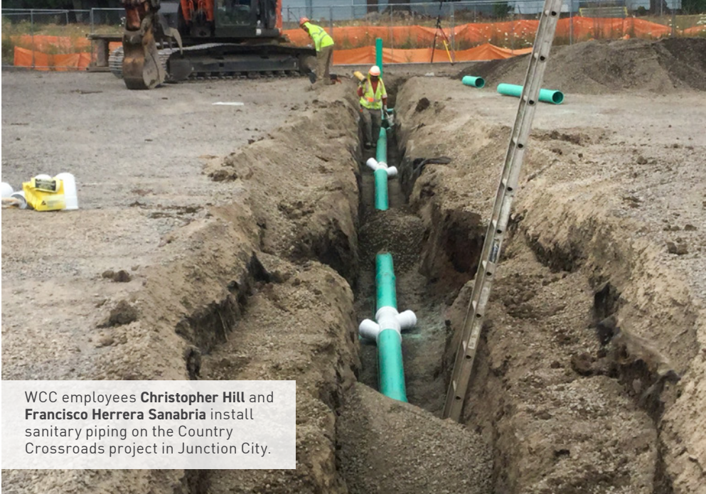
WCC employees Christopher Hill and Francisco Herrera Sanabria install sanitary piping on the Country Crossroads project in Junction City.

SF of drives/concrete paving, 2,424 LF of curbs, 585 LF of planter walls, 937 LF of valley gutter, along with preparing for 12 building foundations. This crew worked hard. Current work includes site concrete, shallow storm pipe, paving parking lots and preparing for landscaping.