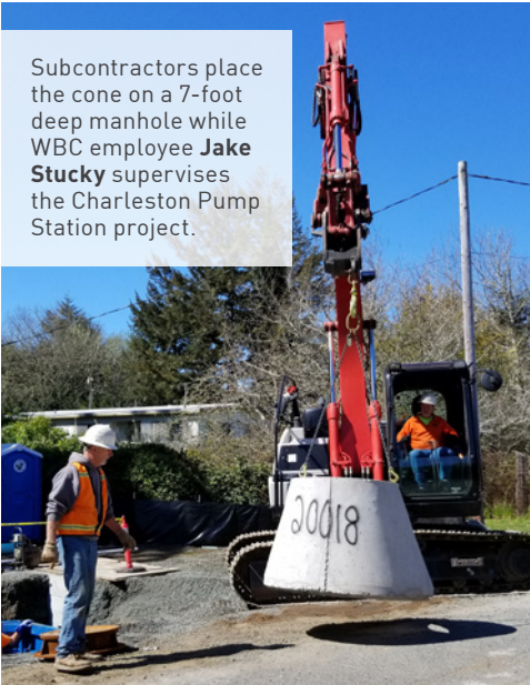
Subcontractors place the cone on a 7-foot deep manhole while WBC employee Jake Stucky supervises the Charleston Pump Station project.

With lots of work out to bid, it looks like another busy year.