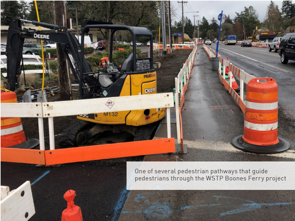
One of several pedestrian pathways that guide pedestrians through the WSTP Boones Ferry project