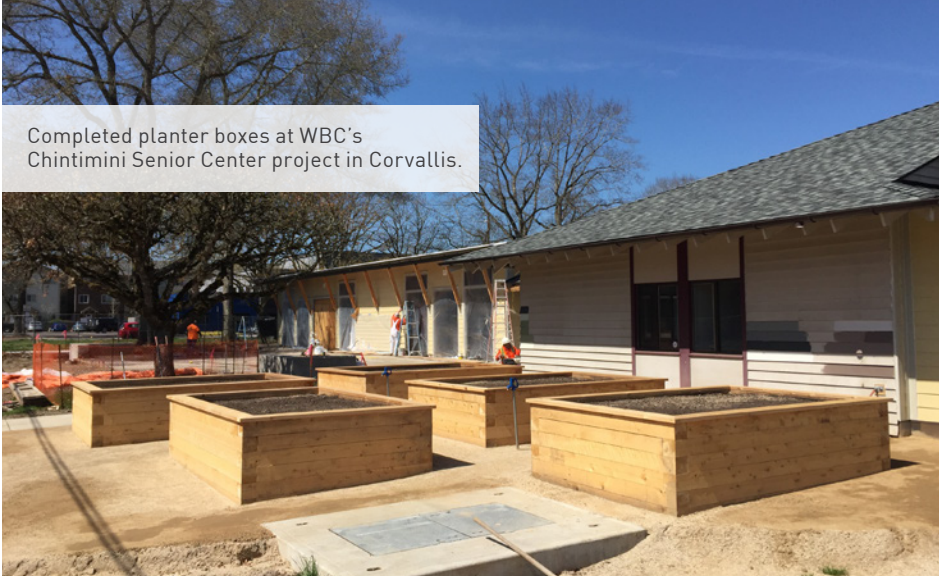
Completed planter boxes at WBC’s Chintimini Senior Center project in Corvallis.