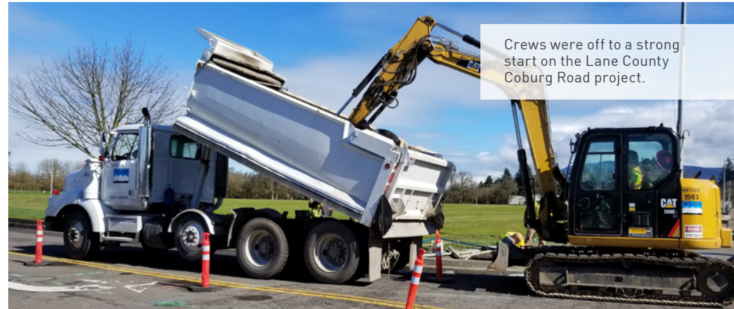
Crews were off to a strong start on the Lane County Coburg Road project.