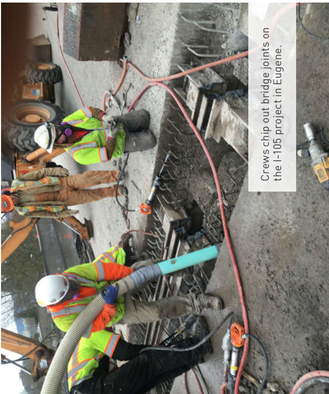
Crews chip out bridge joints on the I-105 project in Eugene.