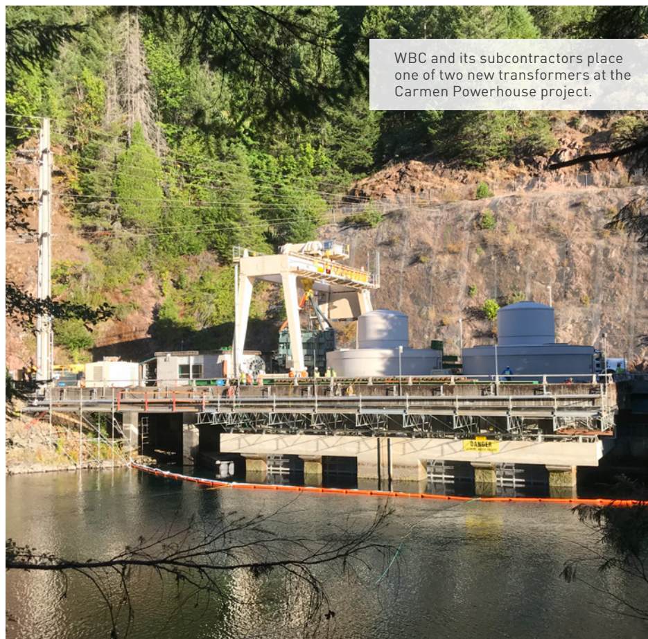
WBC and its subcontractors place one of two new transformers at the Carmen Powerhouse project.