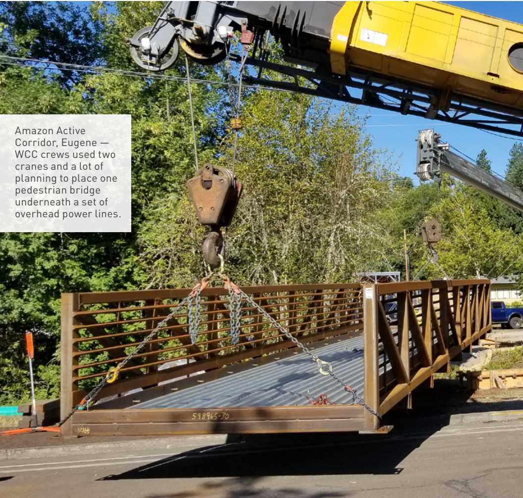
Amazon Active Corridor, Eugene — WCC crews used two cranes and a lot of planning to place one pedestrian bridge underneath a set of overhead power lines.